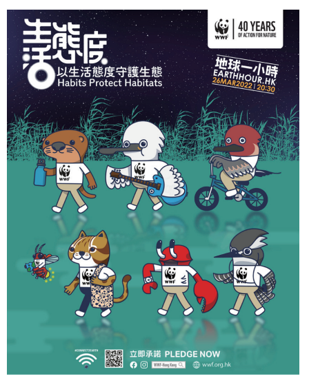
承諾支持世界自然基金會地球一小時 IS COMMITTED TO WWF'S EARTH HOUR

The Group's Head Office joined the millions of people around the globe and turned off its office lights in support of WWF's Earth Hour, an annual event to raise awareness of climate change.