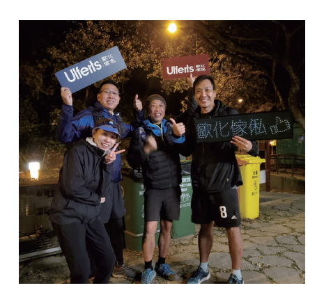
Ulferts International Limited 歐化國際有限公司